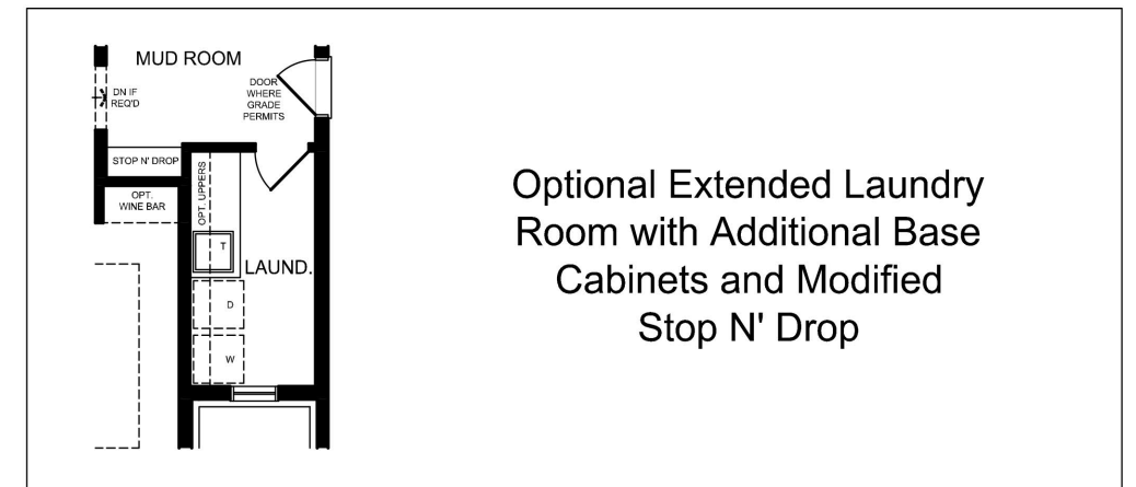
Optional Extended Laundry Room with Additional Base Cabinets and Modified Stop N' Drop