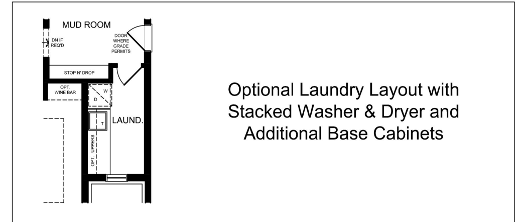
Optional Laundry Layout with Stacked Washer & Dryer and Additional Base Cabinets